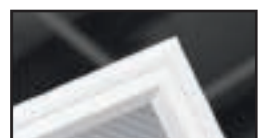
RA Static Regressed Aluminum • Extruded aluminum with mitered corners. • Regressed 1/4".