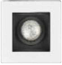
LCI31 Adjustable gimbal white trim w/black baffle 4-5/8" sq. (117 mm) Housing Lamp Wattage R4ASIC PAR16 55W