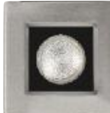
R457SL Adjustable brushed nickel trim w/ brushed nickel cone 4-5/8" sq. (117 mm) Housing Lamp Wattage R4ASIC PAR20 50W PAR16 55W

Philips Capri reserves the right to make changes without notice.©2009