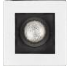
LCI34 Adjustable gimbal white trim w/ black cone 4-5/8" sq. (117 mm) Housing Lamp Wattage R4ASIC PAR16 55W