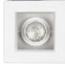
LCI36 Adjustable gimbal white trim w/white cone 4-5/8" sq. (117 mm) Housing Lamp Wattage R4ASIC PAR16 55W