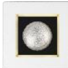
R453 Adjustable white trim w/gold cone 4-5/8" sq. (117 mm) Housing Lamp Wattage R4ASIC PAR20 50W PAR16 55W