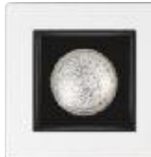
R451 Adjustable white trim w/black baffle 4-5/8" sq. (117 mm) Housing Lamp Wattage R4ASIC PAR20 50W PAR16 55W