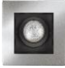
LCI34M2 Adjustable gimbal chrome trim w/black cone 4-5/8" sq. (117 mm) Housing Lamp Wattage R4ASIC PAR16 55W