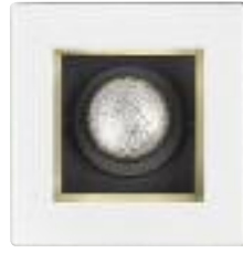
LCI33 Adjustable gimbal white trim w/ gold cone 4-5/8" sq. (117 mm) Housing Lamp Wattage R4ASIC PAR16 55W