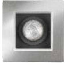
LCI36M2 Adjustable gimbal chrome trim w/white cone 4-5/8" sq. (117 mm) Housing Lamp Wattage R4ASIC PAR16 55W