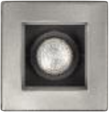
LCI37SL Adjustable gimbal brushed nickel trim w/brushed nickel cone 4-5/8" sq. (117 mm) Housing Lamp Wattage R4ASIC PAR16 55W