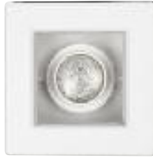
LCI31W Adjustable gimbal white trim w/white baffle 4-5/8" sq. (117 mm) Housing Lamp Wattage R4ASIC PAR16 55W