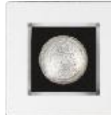
R452 Adjustable white trim w/clear cone 4-5/8" sq. (117 mm) Housing Lamp Wattage R4ASIC PAR20 50W PAR16 55W