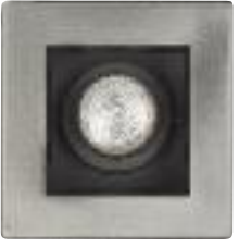
LCI34M1 Adjustable gimbal brushed nickel trim w/black cone 4-5/8" sq. (117 mm) Housing Lamp Wattage R4ASIC PAR16 55W