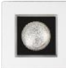
R456 Adjustable white trim w/white cone 4-5/8" sq. (117 mm) Housing Lamp Wattage R4ASIC PAR20 50W PAR16 55W