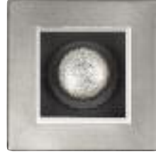
LCI36M1 Adjustable gimbal brushed nickel trim w/white cone 4-5/8" sq. (117 mm) Housing Lamp Wattage R4ASIC PAR16 55W