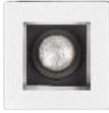
LCI32 Adjustable gimbal white trim w/ clear cone 4-5/8" sq. (117 mm) Housing Lamp Wattage R4ASIC PAR16 55W