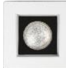
R451W Adjustable white trim w/ white baffle 4-5/8" sq. (117 mm) Housing Lamp Wattage R4ASIC PAR20 50W PAR16 55W