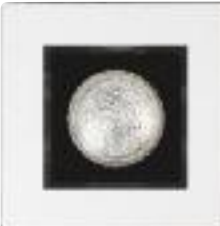
R454 Adjustable white trim w/black cone 4-5/8" sq. (117 mm) Housing Lamp Wattage R4ASIC PAR20 50W PAR16 55W