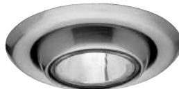
3A30CPR (Shown) Copper Eyeball

35° Vertical Lamp Tilt 3-5/8" O.D. (92 mm) 35WMR16