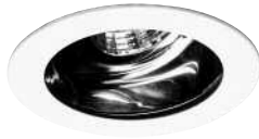
3A70CLR (Shown) Clear Reflector w/White Flange

35° Vertical Lamp Tilt 3-5/8" O.D. (92 mm) 35WMR16